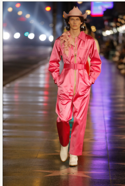
GUCCI SPRING/SUMMER 2022