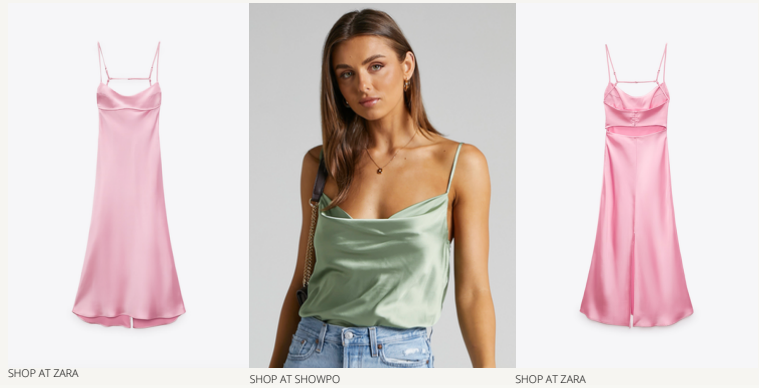
SHOP AT ZARA

Spring and summer are calling for this sleek look, you better pick up the phone.