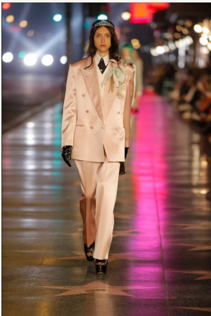
GUCCI SPRING/SUMMER 2022

Gucci and Marques Almeida are amongst the plethora of designers giving their ode to the seventies. Suited in silk Gucci proves that a look surrounded by one fabric no longer just belongs to the Canadian tuxedo. Experimenting with cuts and colors in this line, Gucci demonstrates how truly multidimensional satin is, and can be incorporated into many elements of life. Almeida swept through fashion week with floor-length silk gowns, several of them being strapless- concentrating their emphasis on the natural fall of the fabric and its accents to the model's natural features.