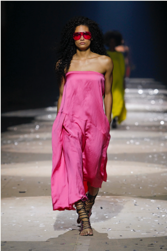
MARQUES ALMEIDA SPRING/SUMMER 2022

Gucci and Marques Almeida are amongst the plethora of designers giving their ode to the seventies. Suited in silk Gucci proves that a look surrounded by one fabric no longer just belongs to the Canadian tuxedo. Experimenting with cuts and colors in this line, Gucci demonstrates how truly multidimensional satin is, and can be incorporated into many elements of life. Almeida swept through fashion week with floor-length silk gowns, several of them being strapless- concentrating their emphasis on the natural fall of the fabric and its accents to the model's natural features.