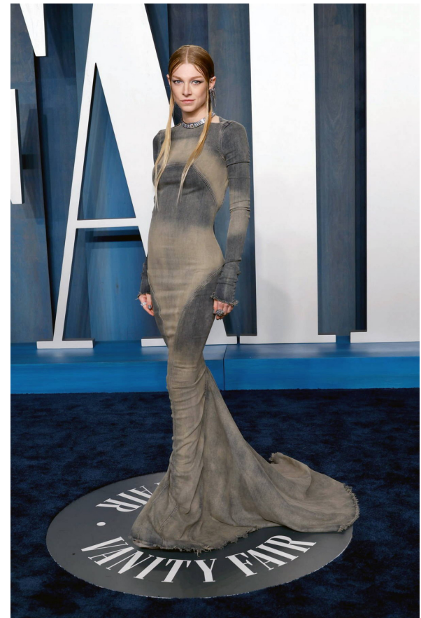
Rosario Dawson for Thom Brown

Hunter Schafer stuns in 50 shades of gray, with a silhouette that could only belong to Rick Owens. In a multi wash denim gown, the Euphoria star wears the signature cut from her collarbone to the floor. With a bodycon fitting, this sleek look falls towards the fingertips with a raw hem that cohesively pairs with a matching slashed train. Are we obsessed with the sophisticated glow Schafer is delivering? Absolutely. This look isn't too young or frilly, it delivers us the maturity the Oscars call for.